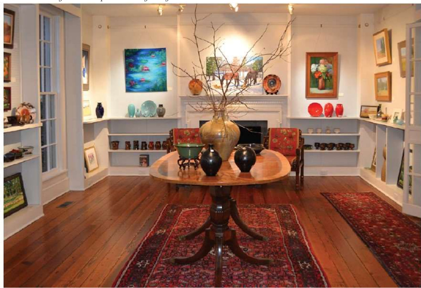
The Sales Gallery in the Campbell birthday today

The Boy Scouts were among the early organizations at Campbell House, along with offices for the Humane Society of Moore County and Moore County Historical Association. In the late 1960s, a small golf museum was set up in the former dining room, and this collection was later turned over to the World Golf Hall of Fame.