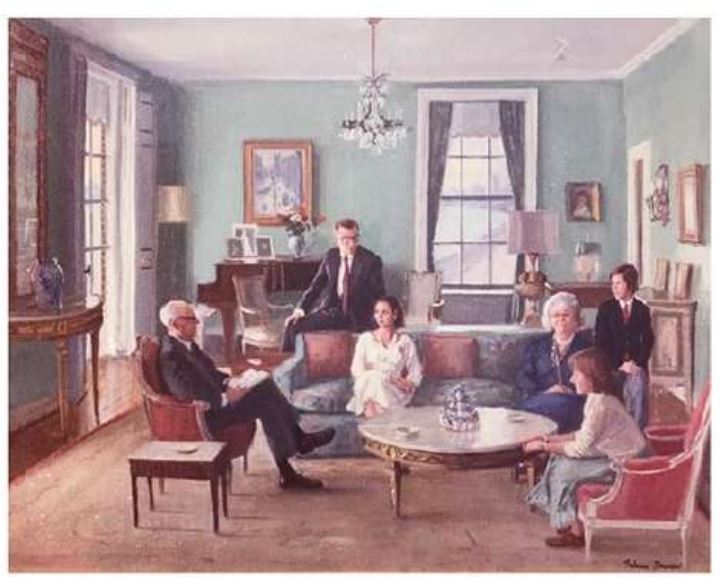
The Campbell family